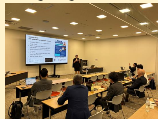
Seminars by overseas research institutes