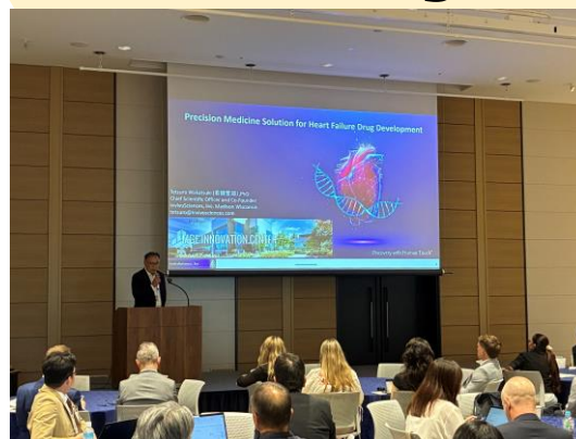
Pitch Session by participating companies