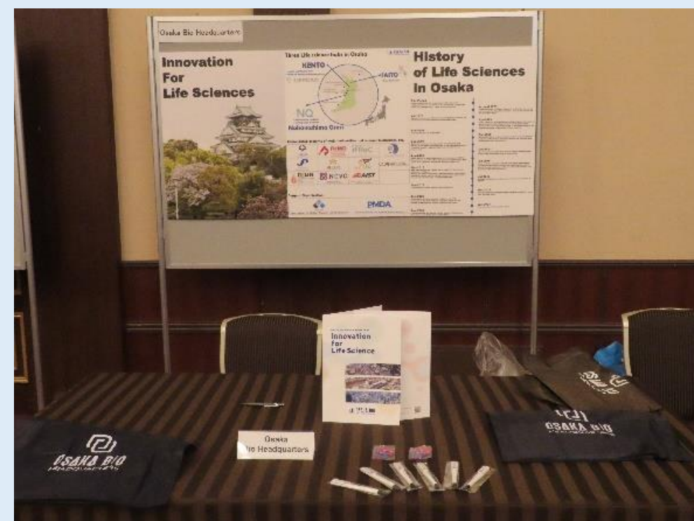
Cluster promotion desk