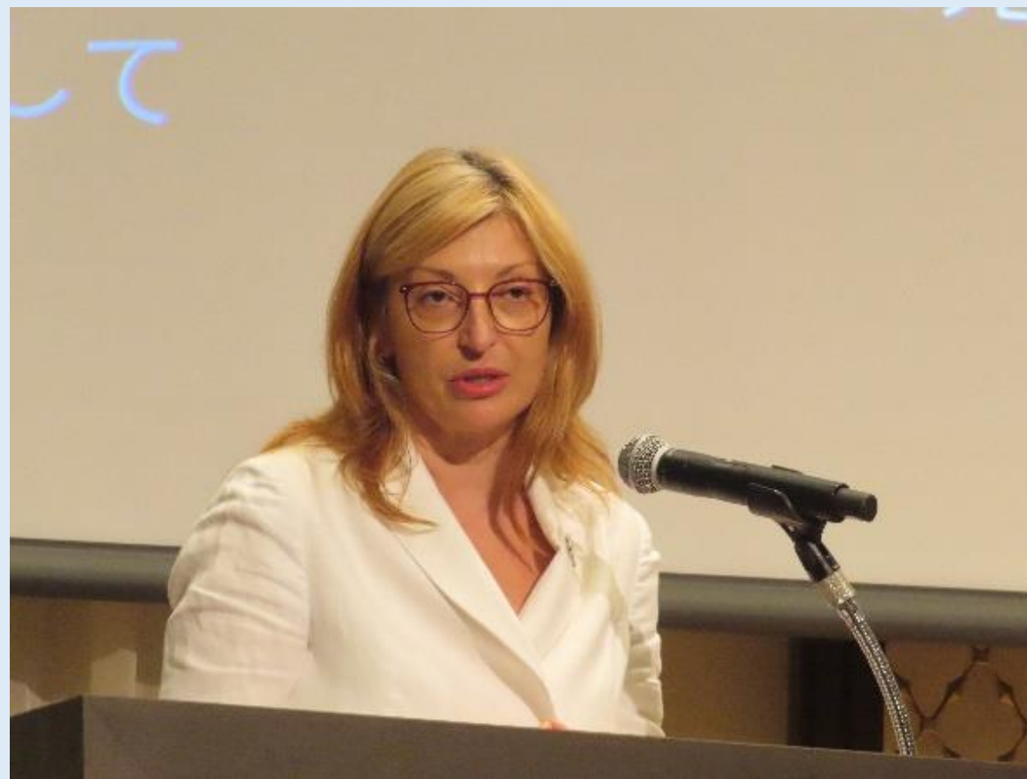
Speech by Ms. Ekaterina Zaharieva, EU Commissioner for Startups, Research and Innovation